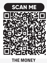
THE MONEY MATTERS: AFCON REPORT