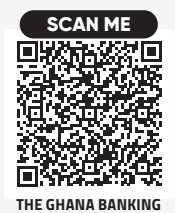
THE GHANA BANKING INDUSTRY REPORT 2023: